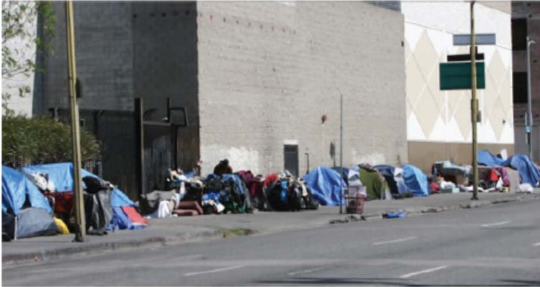
Garcetti's Bizarro Los Angeles.

In the meantime, thousands of Los Angeles taxpayers have become victims of crime, while those who prey upon them go unpunished. This trend will continue as long as there is a Mayor who cares more about thieves, drug abusers and the criminal element than the rest of the law-abiding citizens.