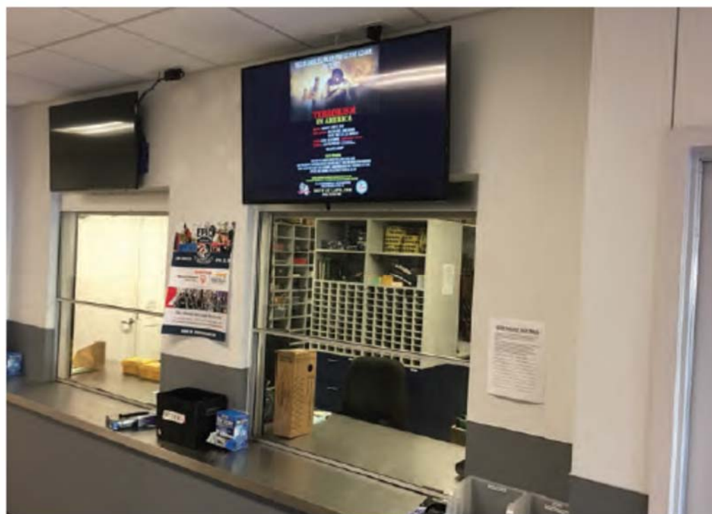
Northeast's E-Bulletin Board will keep you informed on the latest League information and events.