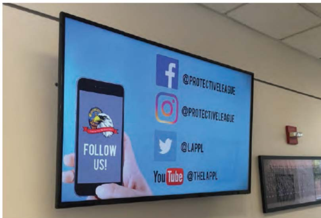
Mission Area's E-Bulletin Board is just one of many options to stay current with League-related news.