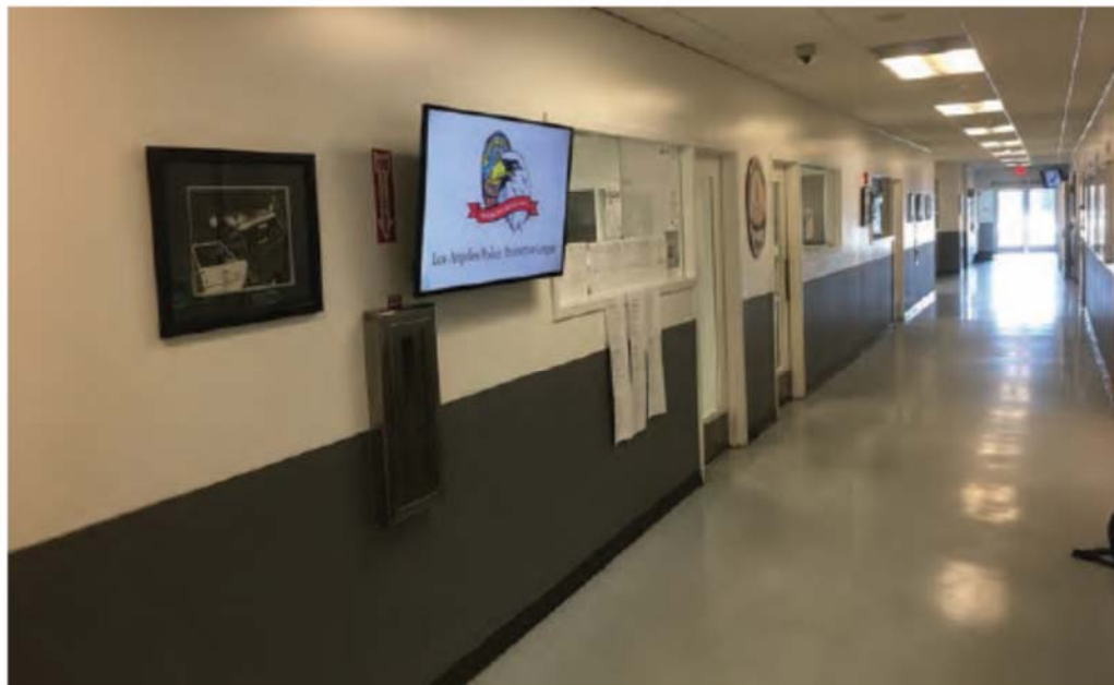
Olympic's E-Bulletin Board hangs prominently in a high-traffic area to keep you informed.