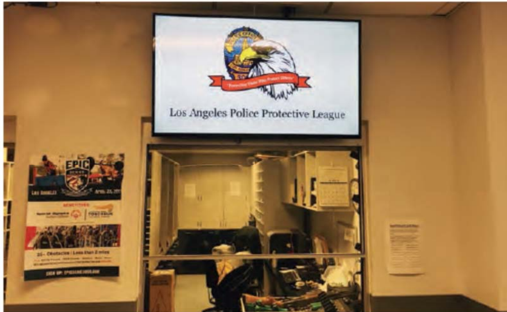
Northeast's E-Bulletin Board courtesy of the League.