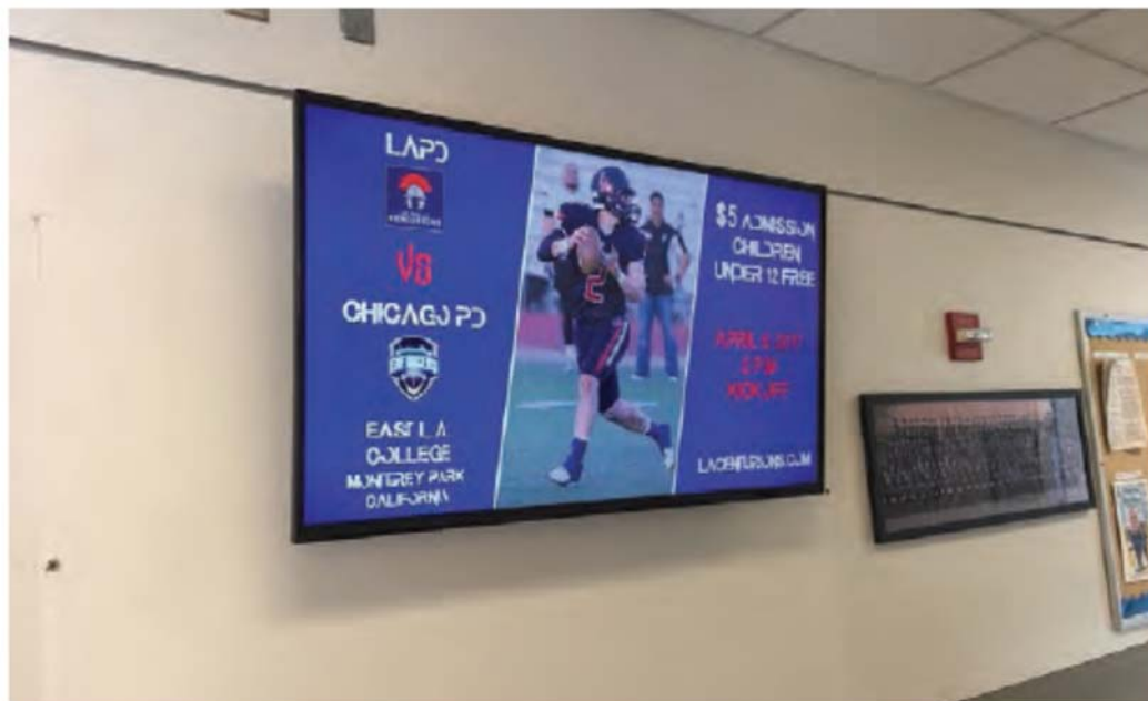
Mission Area's E-Bulletin Board will be another way to connect straight to the members.