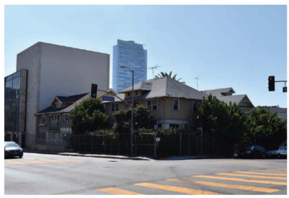
View from across the street of the newly acquired property.

We conducted careful due diligence prior to completing the purchase by retaining real estate experts and seeking outside review of our investment strategy by executives in the development industry who did not have a financial interest in the transaction.