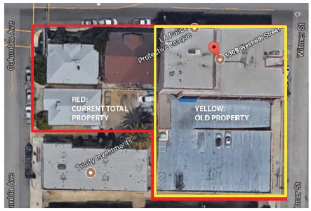
Google satellite view of the current property and the newly acquired property.

In an effort to improve our operational efficiency and invest in our long-term financial stability, the League has purchased the property immediately adjacent to our current office building. The property, located at 1312 West 8th Street, currently has three uninhabitable houses on the lot. The purchase price was $3.7 million.